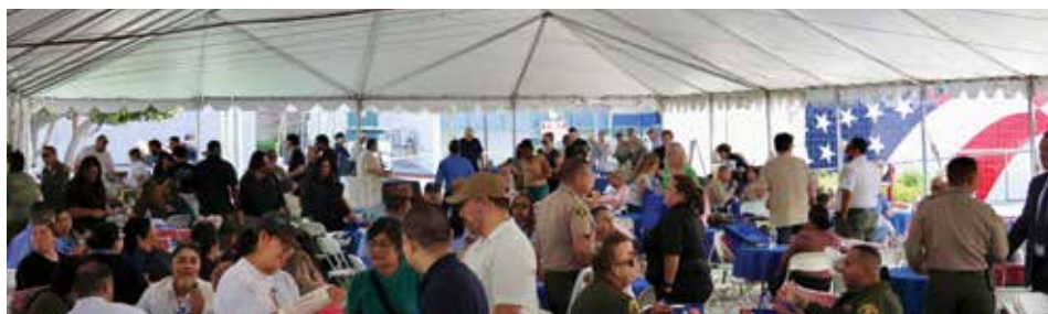
PPOA 24TH ANNUAL PRE-LABOR DAY BBQ AND GENERAL MEMBERSHIP MEETING