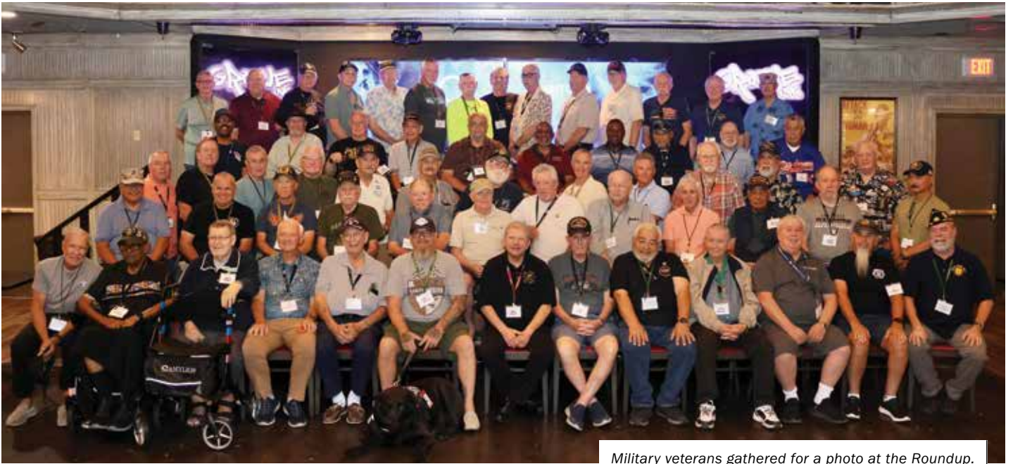
Military veterans gathered for a photo at the Roundup.