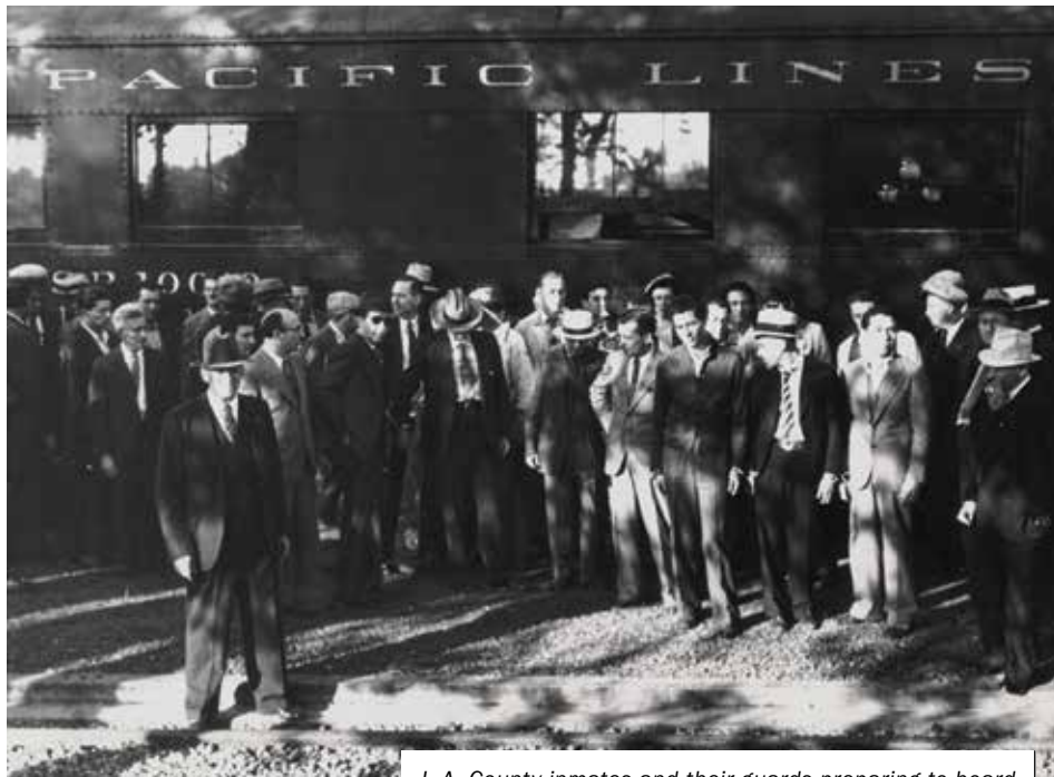
L.A. County inmates and their guards preparing to board the train for transport to San Quentin (August 13, 1934)